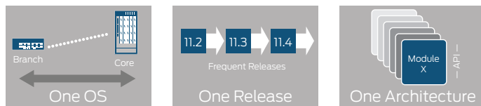
Figure 2: Junos OS utilizes a single source code, adheres to a consistent and predictable release train, and employs a single modular architecture.

These attributes are fundamental to the core value of the software, enabling all products powered by the Junos OS—routers and switches—to be updated simultaneously with the same software release. All features, new and old, are fully regression-tested, making each new release a true superset of the previous version. Customers can deploy a new Junos OS release with complete confidence that all existing capabilities will operate in the same way and be compatible on all Juniper Networks switches and routers in the network.